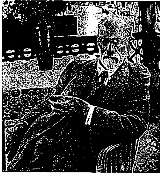
FATHER FIGURE The doctor's debunkers distanced themselves three years ago, but cool heads prevailed